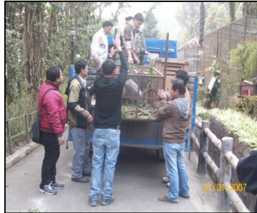
Animals and Pheasants being sent to Delhi and Nainital Zoo