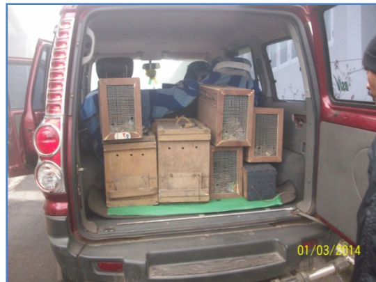
Pheasants sent to Mini Zoo, Jhargram