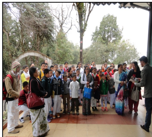
Students during the interaction session