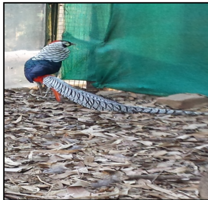
Lady Amherst and Himalayan Goral at Satellite facility, Dow Hill