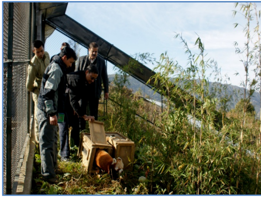
The Chief Secretary during the inauguration of the new Red Panda enclosure at Topkedara