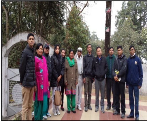
Staffs of NTNC, Nepal with zoo staffs