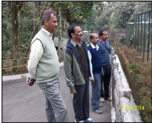
Officials of Mysore zoo